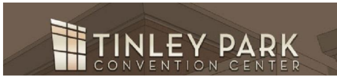
Exhibit Services Order Form

Event Name: Midwest Security & Police Expo 2024 _____